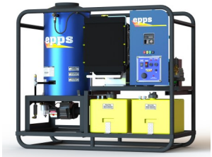
Available with diesel engine

Engine and pump mounted on vibration mounts for smooth operation and long life.